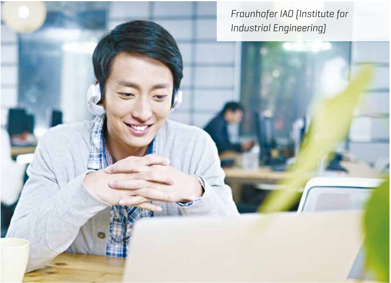
Fraunhofer IAO (Institute for Industrial Engineering)