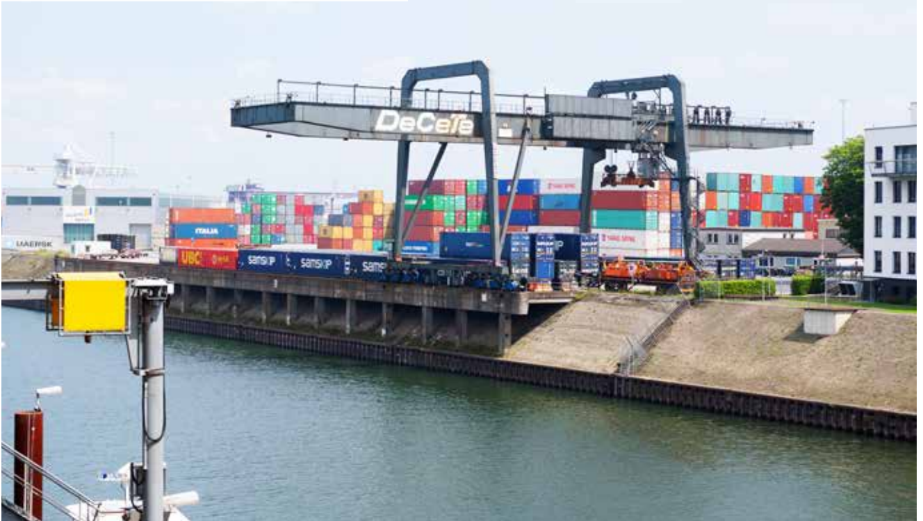
Carl Duisberg Centren (CDC)