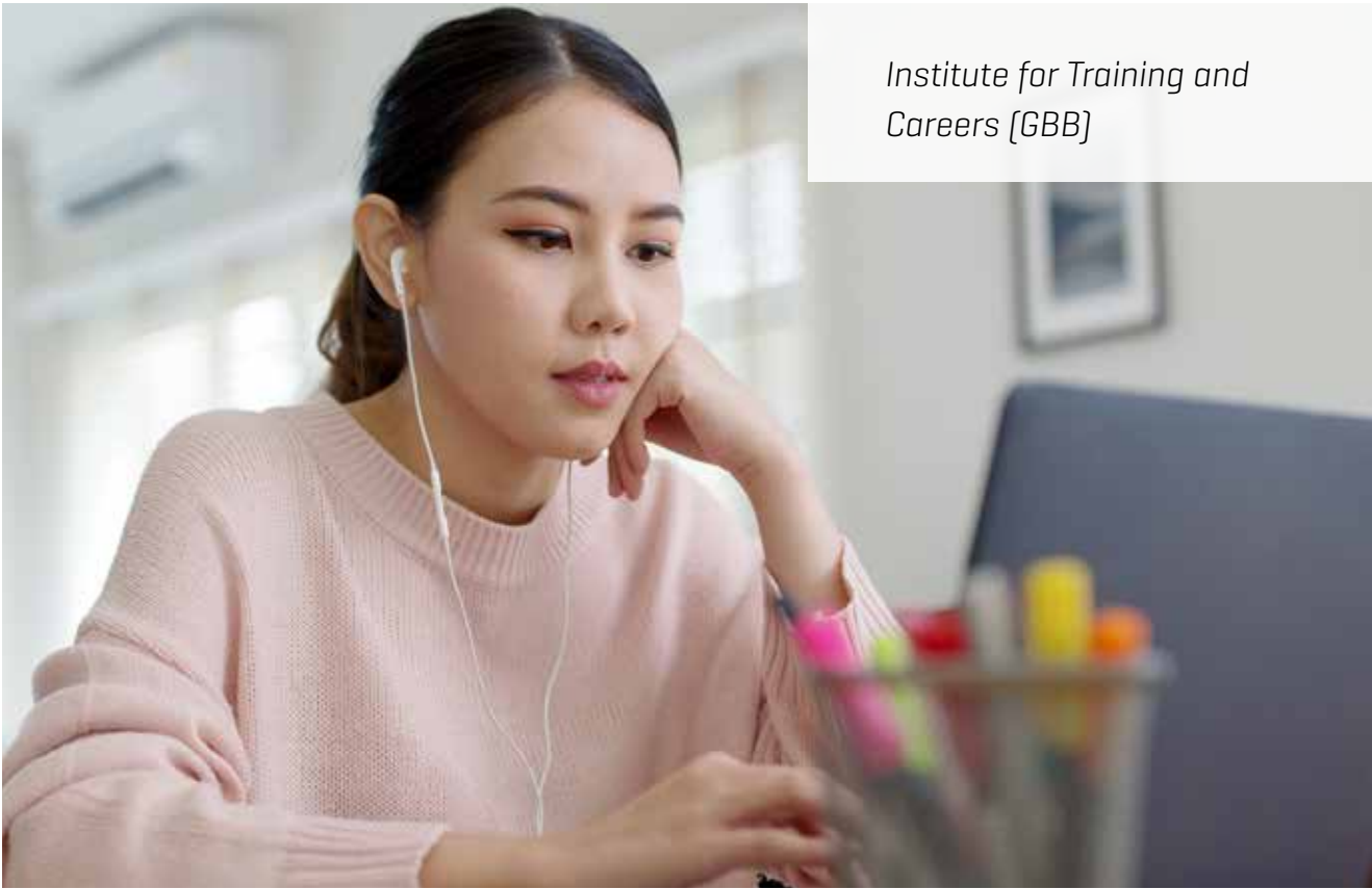
Institute for Training and Careers (GBB)